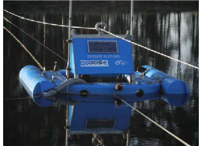
*Typical Attachment Photo. Photos for general guidance. Contact us for further details.