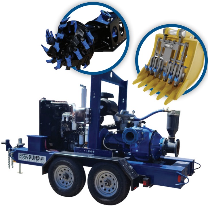
*Typical Deployment Photo. Dredge pumps can be deployed vertically or horizontally. Photos for general guidance. Contact us for further details.