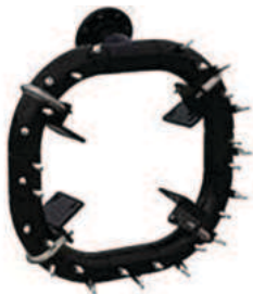
WATER JETTING RING

Enhance your pumping and dredging abilities with our premium add-ons. Our specialized equipment is designed to optimize your project by increasing solids production of your pump. Attachable add-ons are easy to install as the need arises. Contact us today to learn about the best add-ons available for your project.